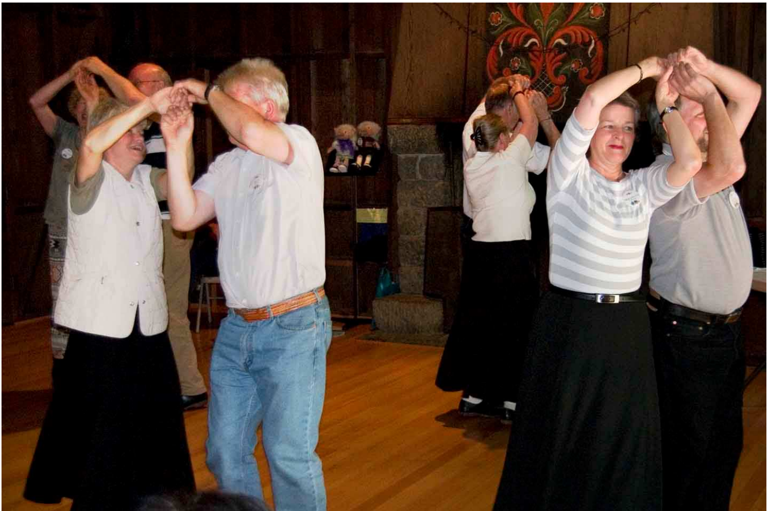
Scandia Camp Mendocino, June, 2007, Dance class.

Plan to join us next June and be a part of this international diplomacy...building links between Scandinavia and America. See :< http://www.scandiacampmendocino.org/ >