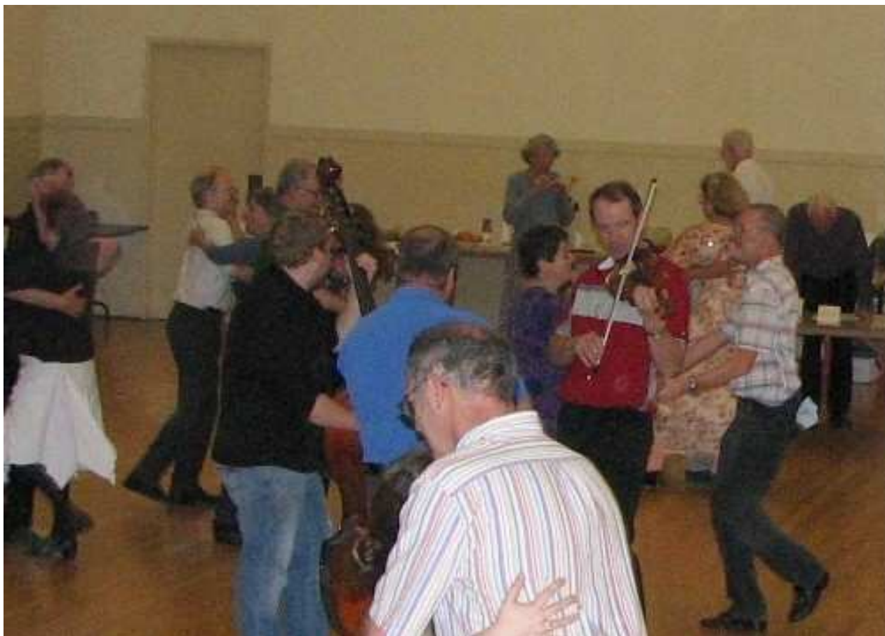
Dance after the mini concert.